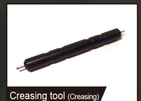
Creasing tool (Creasing)