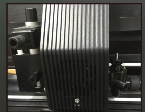
Dual Tool Holders (Creasing)